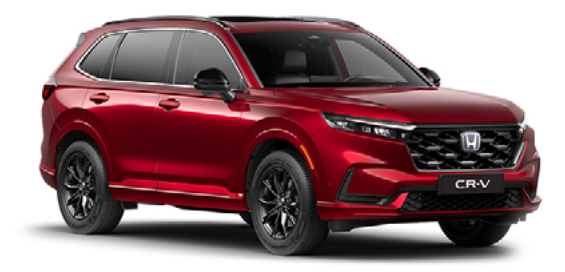
Advance Tech - Plug in Hybrid The Advance Tech grade includes: