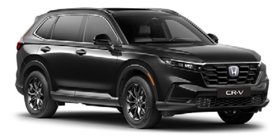
Advance - Full Hybrid In addition to the features available on the Elegance grade, the Advance grade includes: